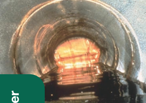
Old / Corroded Pipe