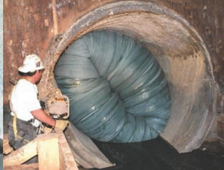
Inserted liner for repair