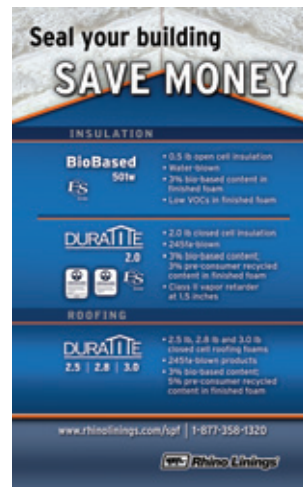
Banner 2 of set