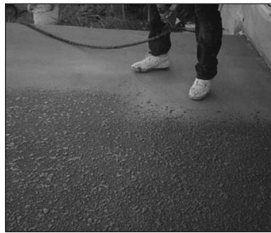
1. Spray the Spray Texture Mix at a 75 – 80% coverage rate to achieve an even textured profile.

The best method to apply Sealcoat 1000 over the Spray Texture, is to spray a thin coat of sealer using a pump-up sprayer, followed by a 1/2 – 3/4" nap roller to leave a thin, even coat. Using this method the coverage rate should be 400 sq. ft. per gallon. Pour the sealer through a paint strainer before spraying to prevent the tip from clogging.