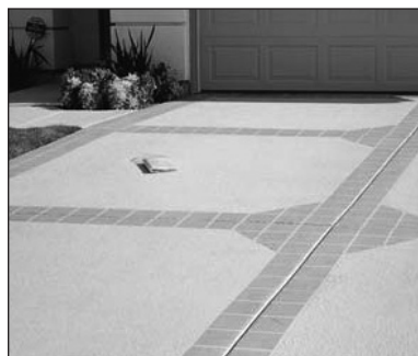
Decorative borders or stencil patterns can be applied to enhance the appearance of the Spray Texture Finish.