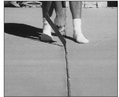
4. Scrape out any material that got in the joints using a trowel or scraper before it dries too hard.