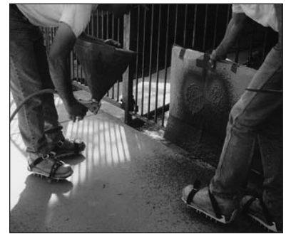
2. Mask off surrounding areas to prevent over spray or use a cardboard shield next to the edges.