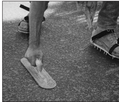
3. While wearing spiked shoes knock the spray texture down flat before it dries using a trowel.