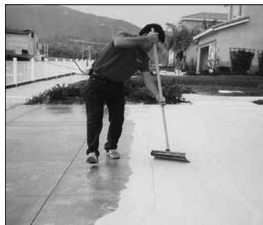
Apply a Bond Coat/Resurfacer using a 24" metal edge squeegee.

APPLICATION INSTRUCTIONS: It is recommended to first apply a thin Bond Coat of Concrete Solutions Resurfacer and allow to dry prior to the application of Texture-Top. Mask off areas to prevent over spray or a cardboard shield can be used. After Texture-Top is applied, sealing with Concrete Colorcoat is recommended. If using Concrete Colorcoat, it is best to pigment the Resurfacer with Concrete Solutions Integral Color Powder the same color as the Concrete Colorcoat that will be used. For extra stain resistance or on driveways, apply a topcoat seal of Sealcoat 1000 clear. Texture-Top can also be sealed with Stamped Concrete Sealer or Acrylic Urethane.