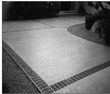
Texture-Top with Brick Border Design

1/8" (3.2 mm) Stamped Texture – Stencils or grout tape can be applied over the Resurfacer to create border or accent designs. Tightly trowel the Texture-Top over the stenciled/taped concrete to break the surface tension, and then spread the Texture-Top at a thickness between 1/16 – 1/8" (1.6 – 3.2 mm). Let it sit for 10 – 25 minutes then spray Concrete Solutions Liquid Release Agent over the surface and stamp with stone or brick texture skins. Concrete Solutions Antique Release Powder can be added to Liquid Release Agent to give natural stone color variations. For cleaner grout lines, pull tape/stencils shortly after stamping. Seal the 1/8" stamped applications with two coats of Concrete Solutions Stamped Concrete Sealer or Acrylic Urethane. To learn more please attend our monthly training class in Las Vegas.