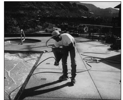
Spray the Spray Texture Mix over the surface using hopper gun spray unit.

Spray-Texture/Trowel Knockdown Finish – Lightly mist the inside of the hopper gun with water. Pour mixed Texture-Top into the hopper gun. Use the second or third largest hole near the tip of the sprayer and set the air pressure between 3 – 15 psi. Spray Texture-Top on a piece of cardboard or plastic to test size and quantity of droplets. Adjust the air pressure and hopper gun tip size to achieve desired spray pattern. If necessary adjust the tip size, the consistency of the mix (by adding more polymer and water or sand), and the air pressure until you achieve the spray pattern desired. It is important to keep fresh batches of material mixed up so the person spraying and troweling do not have to wait or a seam line may be noticeable where you stop and start. If you need to stop somewhere, always stop next to a joint so you can begin again on the opposite side of the joint later. Be careful to protect the finished edge from over spray. To help keep a mix fresh longer especially on hot days, it is recom-