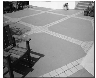
Texture-Top with Tile Border Design

HOW SUPPLIED: Texture-Top is packaged in 50 lbs (22.7 kg) bags.