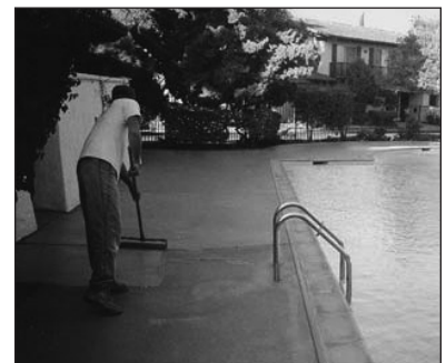
5. After blowing off the surface, apply two coats of Concrete Colorcoat with a paint roller.